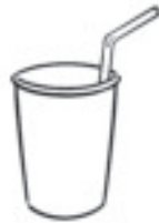
paper cup and straw